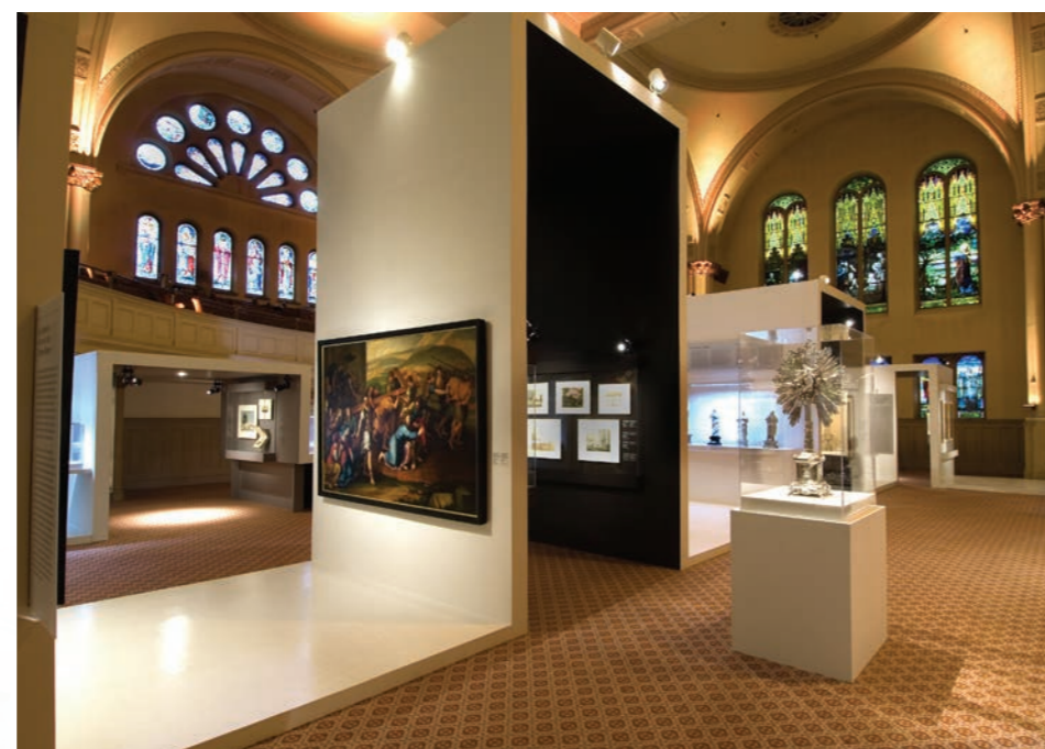
The former Erskine & American United Church, located in downtown Montreal, was built in 1893 based on plans provided by architect Alexander C. Hutchinson. It was acquired in 2008 by the Musée des Beaux-Arts de Montréal. Today its Salle Bourgie receives various exhibits and is home to numerous concerts.