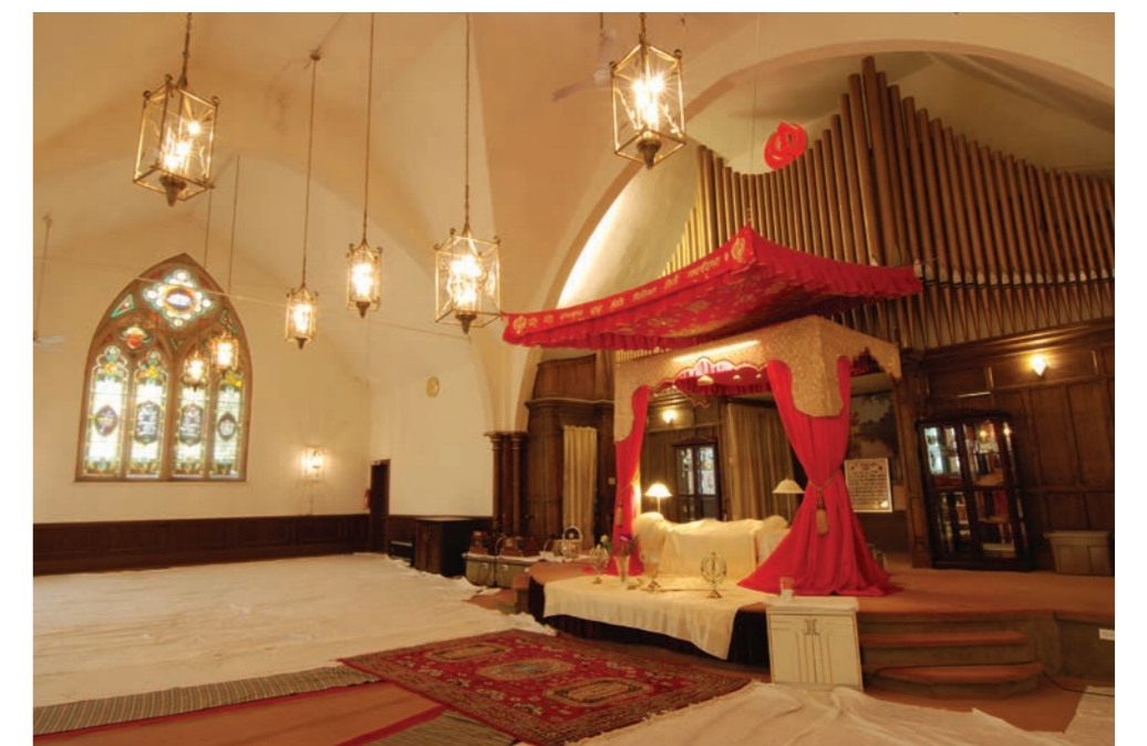
The former Pointe St. Charles Baptist Church was built in 1900 based on plans provided by architect Arthur J. Cooke. It was acquired by the Gurdwara Sahib Temple in 1986. / Photos: Marianne Charland, 2012